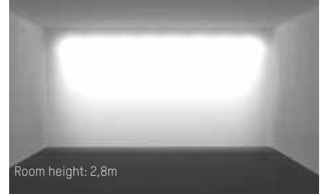
Room height: 2,8m Distance spot - wall: 0,7m / Distance spot - spot: 0,6m