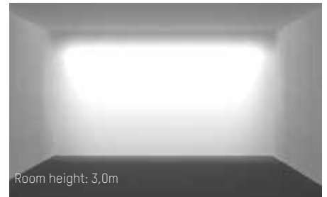
Room height: 3,0m Distance spot - wall: 0,9m / Distance spot - spot: 0,7m

LED Einbauspot aus Aluminium Oberfläche weiß oder schwarz pulverbeschichtet Asymmetrischer mikrofaccettierter Freiformflächenreflektor Gleichmäßiges Licht mit sehr guter Längsentblendung Abdeckung mit hochtransparenter Mikroprismenoptik